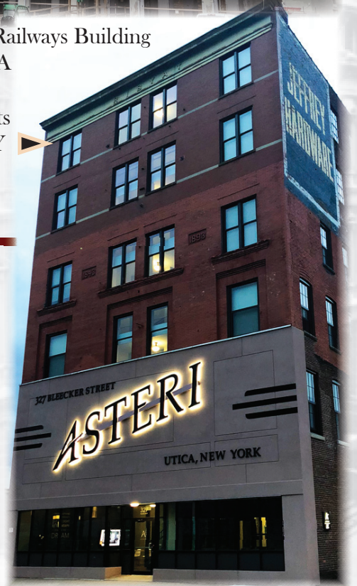
Asteri Apartments Utica, NY