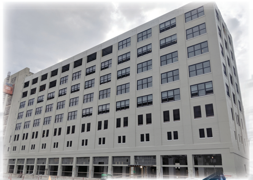
▲ Southern Railways Building Atlanta, GA